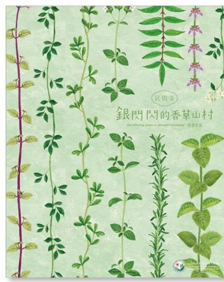
Figure 1. Draft cover page and book title of the 4 picture books on SEPLS of Taiwan. (Chinese version)

Resources, funding: Funding of the publication will be provided by the SWCB. The Seedesign Ltd. Co. will be in charge of book production.