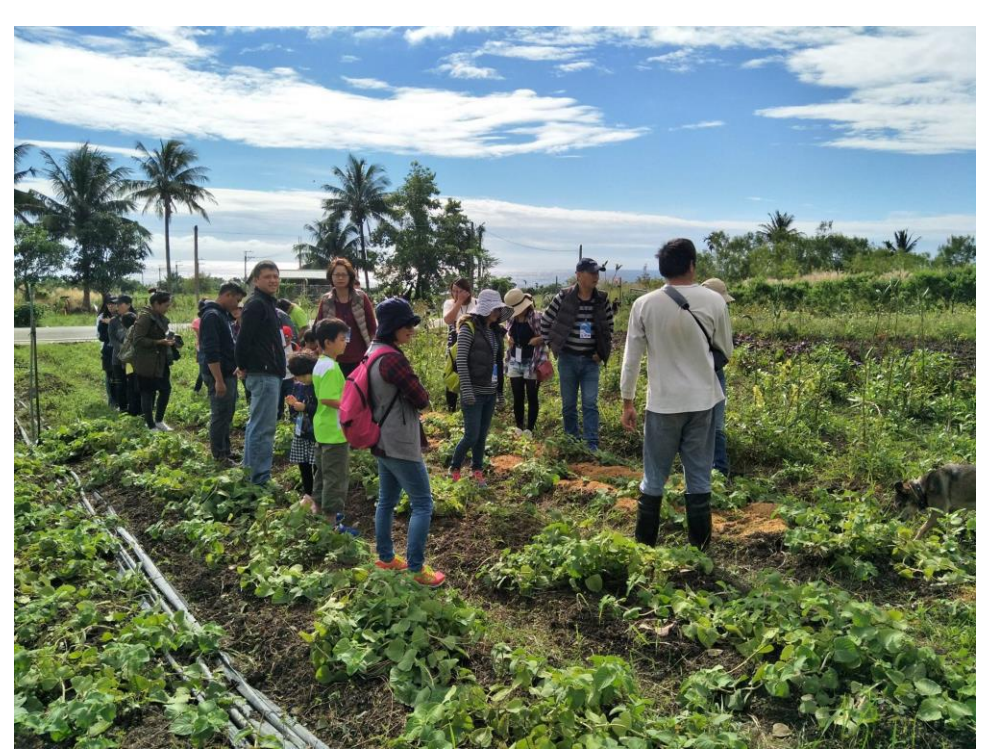
Figure 3. Environmental education and eco-tour are provided by SCDA to visitors, including many youths.

From 2017 to 2018, the SCDA began to use Shangde Elementary School, a school which had been closed for more than a decade because of continuous emigration, as a site for environmental education. Various herbal plants were planted and exhibited here and methods of growing herbal plants were demonstrated. With the assistance of the SWCB Taitung Branch, a business model for herbal industry has been developed in hope to attract more youth to stay and work in Shangde.