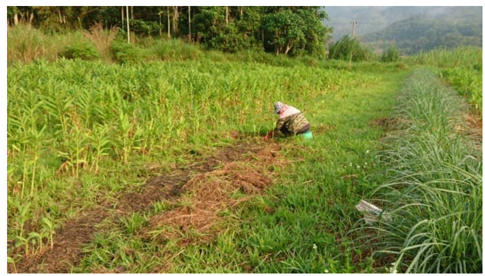
Figure 5. A local woman plants white ginger lily, Hedychium coronarium, a native herb from Taiwan.

In order to increase the cash flow, the Coop Farm began to promote eco-tourism for tourists to experience the century old trees, irrigation ditch, and the unique landscape of Shangde. In 2017, the SCDS and the Coop Farm successfully accessed the right to manage campus of the closed Shangde Elementary School for use of caring the elderly, the children, the "agricultural garden" and environmental education so that the young people with the intention of staying in Shangde could have agricultural training and learning opportunity.