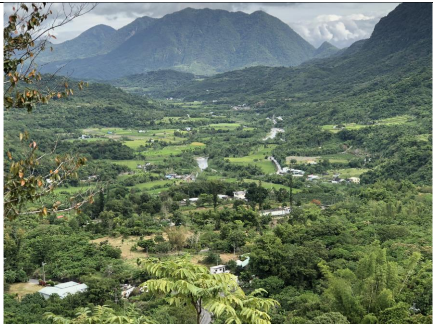
Figure 4. A view of production landscape managed by Shangde community.