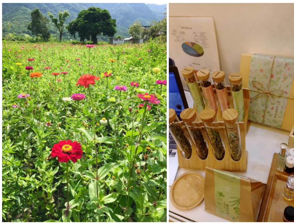
Figure 2. Herbal plants and herbal products from Shangde.

Every few months there will be an overhaul when each family sent out a person and work with others to clean up the silt, mud in the ditch and fix any leakage or collapsed part of the ditch. A party is held after the overhaul. All workers eat, drink and chat together and this is considered as a big event of the community. The maintenance of irrigation ditch thus is not only a job but a shared experience among people who share the water resource. The work-sharing in reality promotes well-being and a greater social cohesion. This living heritage, valued and intentionally kept by the community, is now rarely seen in other places of Taiwan.