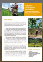
SDM Progress Evaluation Report