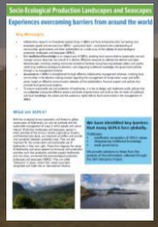
GEF-Satoyama Issue Brief