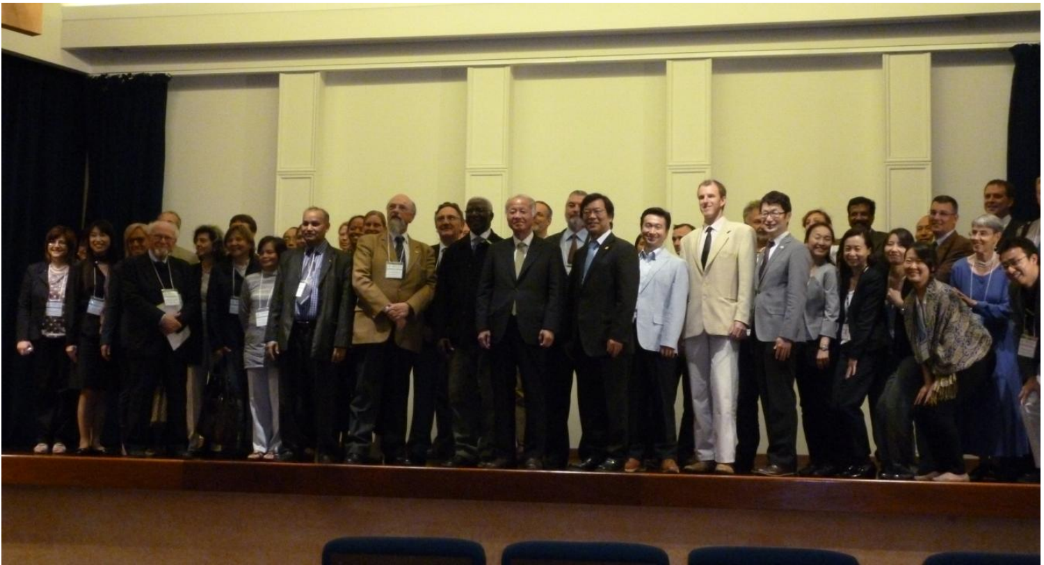
Participants of the Satoyama Initiative European Regional Workshop in Florence