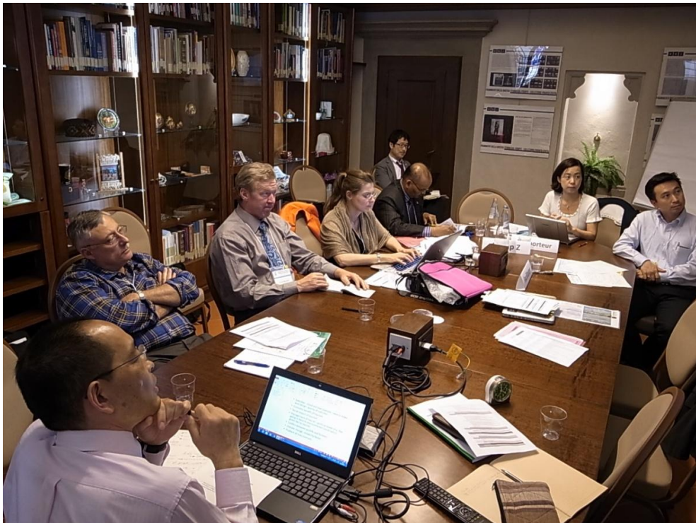
Members of Group Z consider SEPLS issues on a global scale