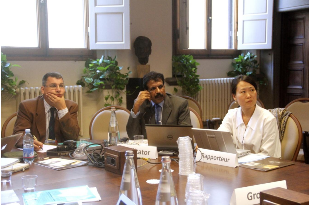
Intense discussions continued into the second day of the workshop