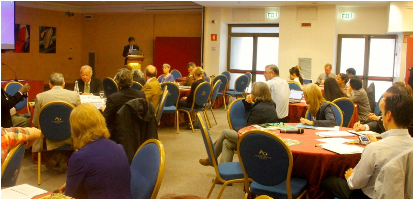
The Satoyama Initiative European Regional Workshop at Auditorium al Duomo, Florence, Italy

It is hoped that this workshop will have the effect of creating closer connections and greater synergy between various organizations promoting the concepts of the Satoyama Initiative in Europe, and lead to concrete steps toward the sustainable management and revitalization of socio-economic production landscapes and seascapes (SEPLS) in the region.