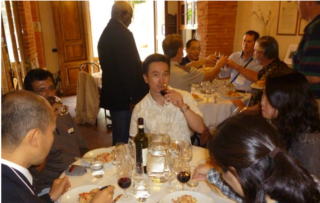
The excursion closed with a sampling of local delicacies

On the way back to Florence, the group stopped by for a short visit to Castello di Querceto's agritourism facilities, where visitors can enjoy a stay in the Tuscan countryside while taking part in actual production activities related to traditional products like wine and olive oil.