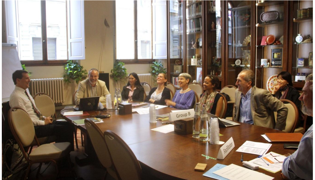
Group B enjoys a laugh during their discussion