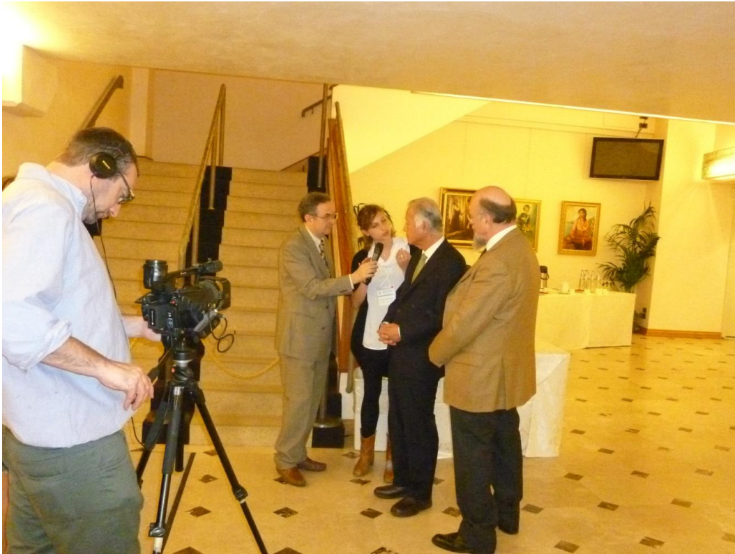
A story about the workshop appeared on Toscana TV, a local television station

As to travel and tourism, it was largely agreed throughout all of the discussion groups that these can be a blessing or a curse, and that care needs to be taken to make sure that they are used and implemented responsibly.