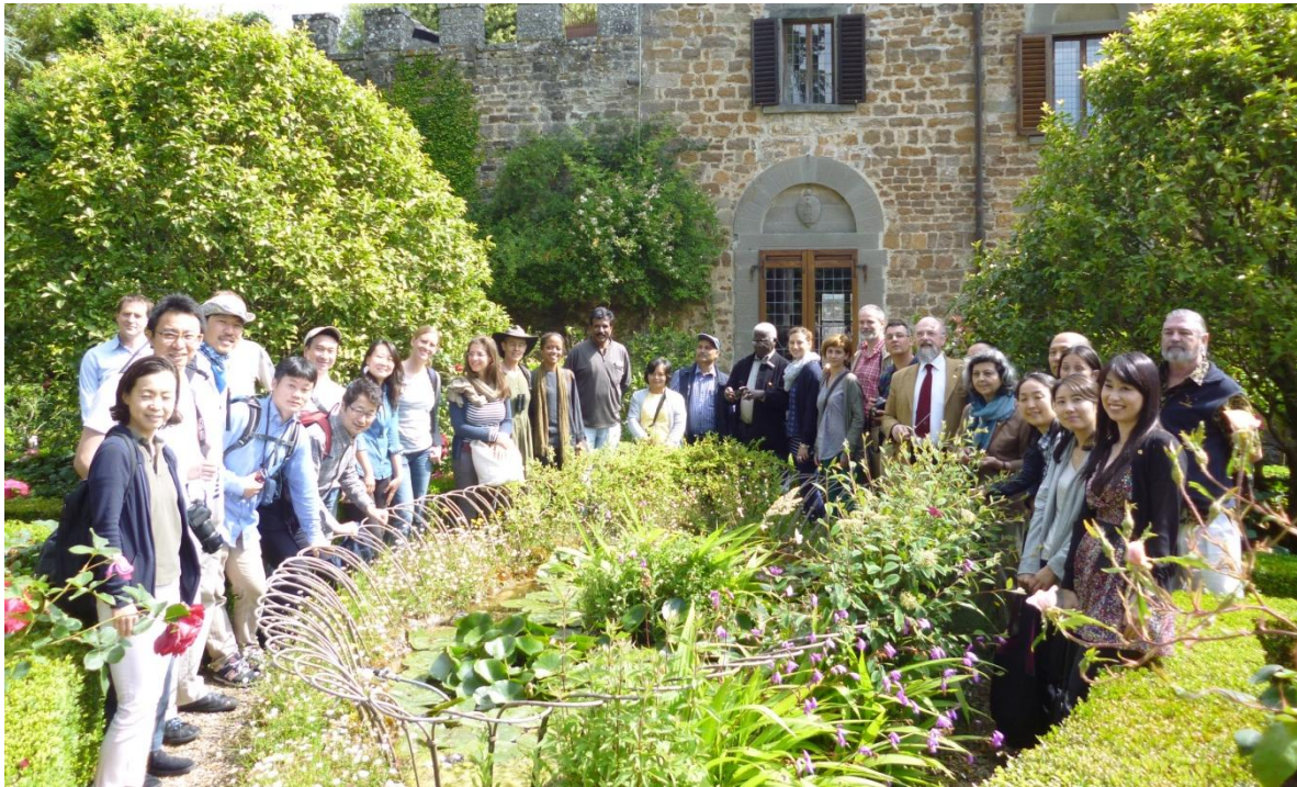
Excursion participants gather in front of Castello di Querceto S.p.A.

An early-morning chartered bus departure from the Auditorium al Duomo took participants on an hour's ride through the rolling hills of Tuscany to the estate. Castello di Querceto's main building began as a castle on one of the major roads of the Roman Empire, but was rebuilt in more or less its modern form in the 16 th century. The tour began with a short walk through its beautifully maintained gardens and a photo opportunity in front of its striking clock tower.