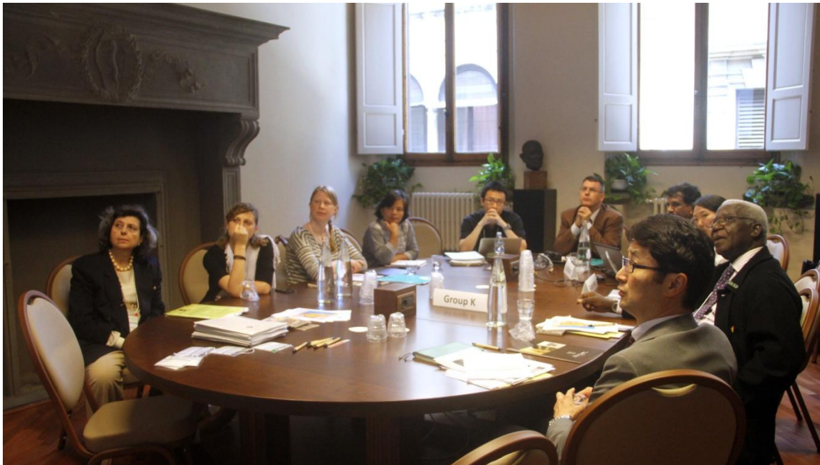
Group K discusses European landscapes

Another short presentation followed, by Dr. Lucio Graziano, President of the International Agency for the Protection of Biocultural Landscapes and for a New Rurality (AGER), based in Italy. Dr. Graziano's presentation was entitled "Reading biocultural landscapes: a new concept for cultural tourism in rural areas, the experience of AGER" and focused on applying a "biocultural approach" to tourism activities related to landscape around the world. This approach implies bringing visitors to imagine the traditional landscape plot observing the few residual tracks remaining and leading them to reflect on traditional peasant culture and its profound linkage with nature. Biocultural landscape reading can be the thematic content of a cultural tourism aimed at discovering the deep identity of a territory and its rural community, complementing and enhancing the quality of tourism offered by wine and food.