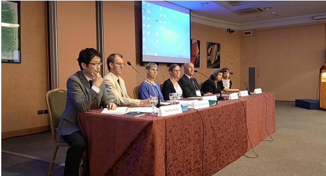
The panel takes questions from the floor

A short question-and-answer session followed the short presentations, with all presenters joining the co-chairs as panelists. Despite the limited time, a lively discussion ensued.