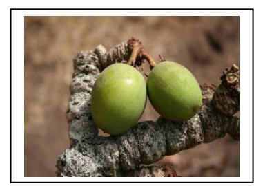
Shea nut fruits