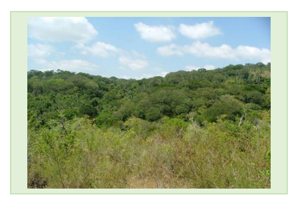
Aerial view of Kaya forest