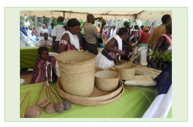
Basketry products made from Kaya forests