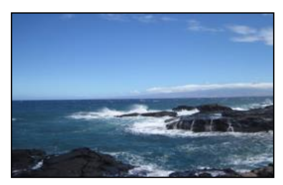
Figure 2. Marine and intertidal ecosystems are important natural settings in the Pacific Islands.

We highlight components from an analysis examining gaps and overlaps between a regionally-derived list of well-being characteristics (the Pacific Island Well-being Elements) and global development targets (the Sustainable Development Goals and Aichi Biodiversity Targets). The Pacific Island Well-being Elements draw from a series of community workshops and were triangulated with an interdisciplinary research team with considerable experience in the Pacific. Together, these 93 elements under 8 dimensions represent critical dimensions of biological and cultural well-being across the Pacific. Results of our coding activity identify the areas where the Aichi Targets overlap and contrast with local-level perspectives of well-being and, presented together with highlights from our complementary efforts, inform recommendations for identifying goals that account for both international and local priorities and outcomes.