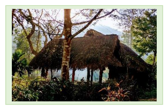
Caption: Wooden house near kitchen.