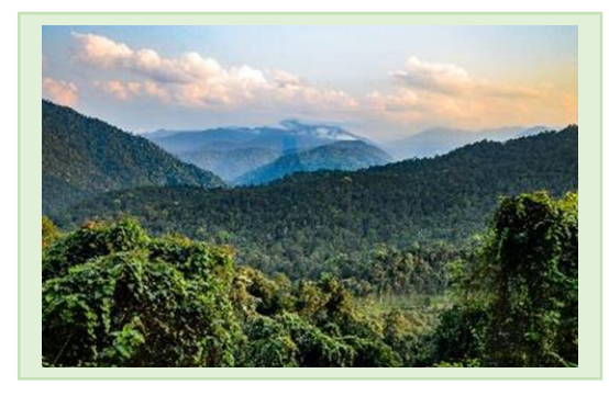
Caption: Forest landscape in HEPA site.

After SDM (2016-2018), the number of people benefitted from field seminars and accessed to seedlings is up to 500 people. Local communities and stakeholders whom have been raised awareness on importance of local trees for species conservation and ecosystem restoration is up to 3000 people. Documentation has continued widely distributed to stakeholders in Vietnam and Lao PDR. Number of local trees planting after SDM is about 30,617 trees on a total area of 38 hectares covering 03 local communities and 12 direct smallholders throughout 05 provinces in Vietnam and Lao PDR.