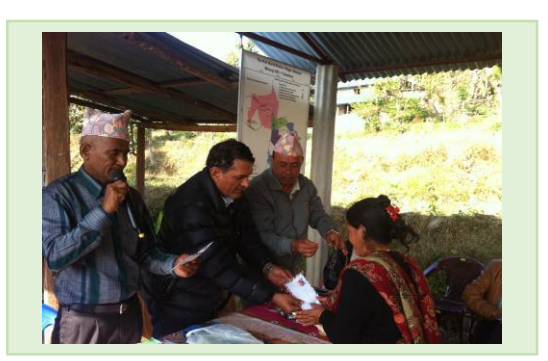
Caption: Lady receiving carbon payment