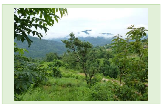
Caption: Forest garden on abandoned agricultural land

BeChange project has been implemented in two villages (Ratanpur and Bandipur) of Tanhu district of Nepal. A total of 42000 mixed tree species that are locally threatened (such as Michelia, Elaeocarpus, Cinnamon tamala) were planted on 50 ha of abandoned agriculture land of 218 farm families. About one-third of the population in these villages falls below the poverty line (base line report). Food produced in private farm lands can feed only 11 percent of households for the whole year. The remaining households depend on off-farm and other sources for their food and survival. Farmers in these villages have been hard-hit by water scarcity. To address the climate related risks and to enhance livelihoods of the people living in these villages, this project provided support to mostly disadvantaged, low-income woman farmers to establish sustainable forest-garden systems on abandoned private farmlands. These activities were linked to cultural eco-tourism, cinnamon leaf essential oil distillation and intercropping of high value shade loving crops such as ginger, turmeric, and lentils. Moreover, the project contributed to the conservation of upstream and downstream watersheds by planting erosion resisting trees and vegetation, and by constructing small irrigation ponds. Since 2016, the project has been mainly financed by voluntary carbon credits paid for atmospheric carbon sequestered in forest biomass and soil applied biochar.