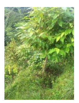
Figure 1 Michelia champaca