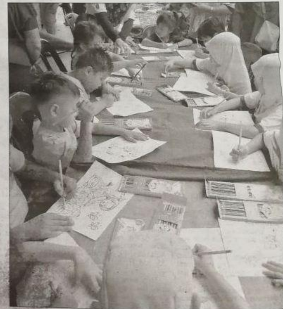
Children's colouring contest