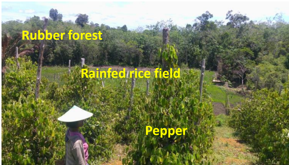
Agriculture landscape in Emperiang