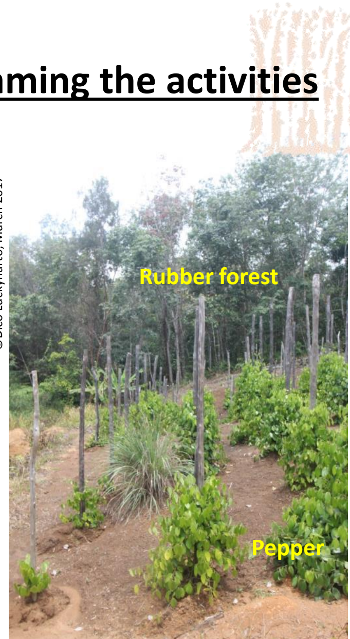
Agriculture landscape in Bati