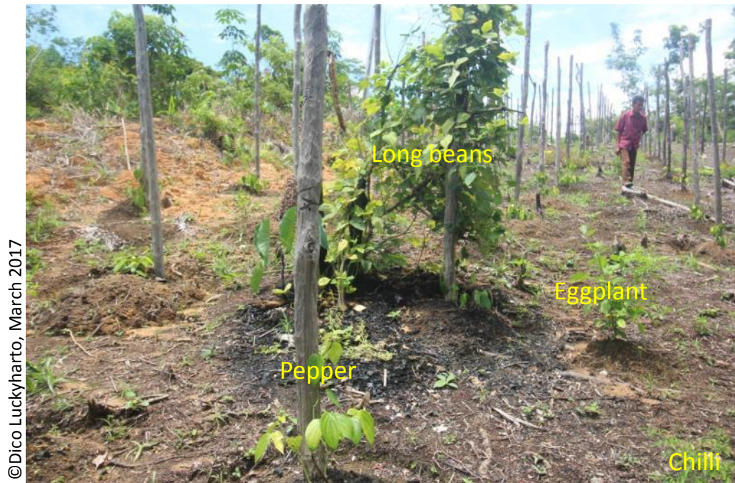
Early stage inter-cropping