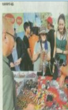
Foreign tourists buy at the handicraft stalls

Apart from fishing competition, other activities held during the festival were cooking competition sponsored by Maggi, water sports,