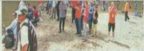
The fishing competition at the scenic part of the river

Apart from fishing competition, other activities held during the festival were cooking competition sponsored by Maggi, water sports, exhibition, sales of food and beverages and children's colouring contest.