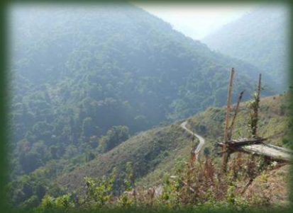
The Energy and Resources Institute (TERI)