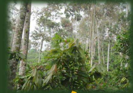
Universidad Industrial de Santander (UIS)