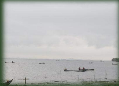
Fauna & Flora International (FFI)