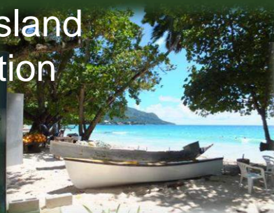
Green Island Foundation (GIF)