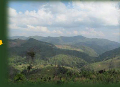
Inter Mountain Peoples' Education and Culture in Thailand Association (IMPECT)