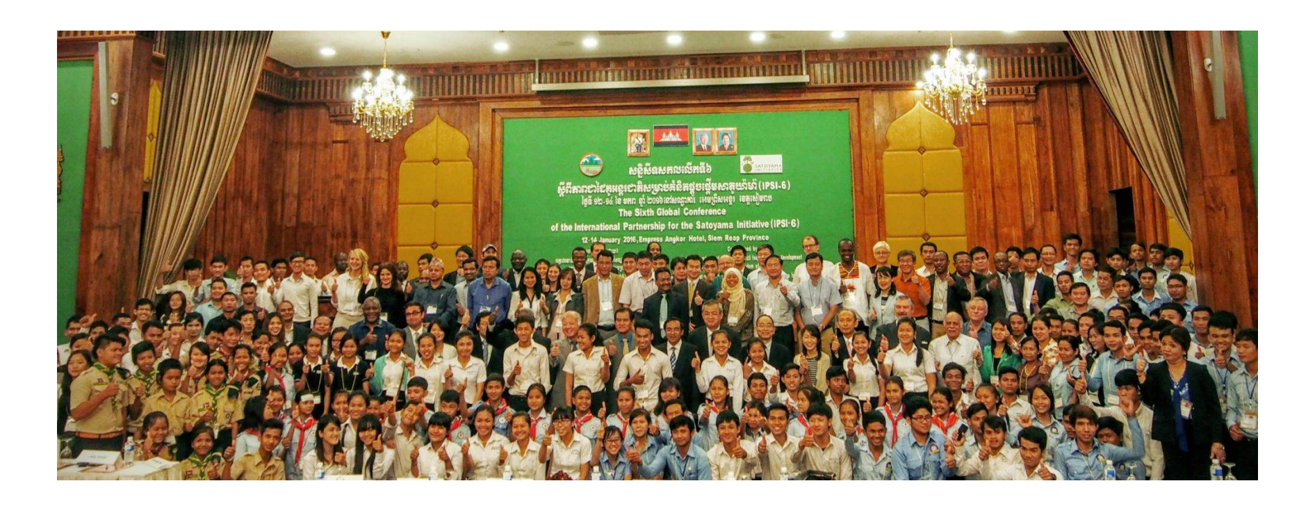
12-14 January 2016, Siem Reap, Cambodia