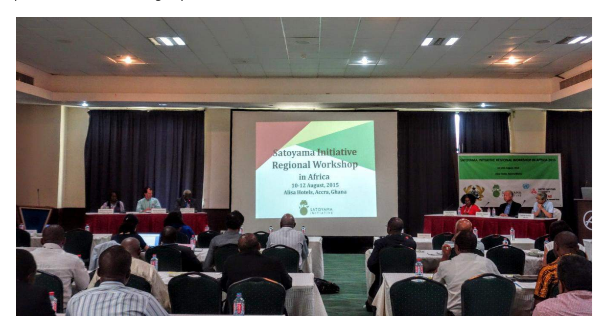
The closing plenary of the Satoyama Initiative Regional Workshop in Africa 2015

The workshop then ended with the IPSI Secretariat providing a brief explanation of the excursion planned for the following day.