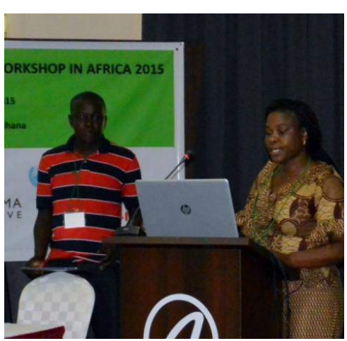
Working group representatives report back to the plenary

The Forest group found that forests in SEPLS are still rich in biodiversity and have benefits in terms of supplying resources, environmental and ecological services such as erosion control and carbon sequestration, and socio-cultural values, but are threatened by unsustainable exploitation, land conversion, indirect pressures including weak governance, harmful incidents like unwanted fires, and the loss of traditional norms and taboos. Opportunities involved higher awareness, participation and capacity as well as concrete actions including governance strategies encouraging alternatives, ownership options, rules and institutions, land strategy and planning and policy integration. Challenges identified were limited understanding of threats, livelihood options and access to finances, and governance issues including conflicts of interest between biodiversity and economic interests, and recognition of ownership and intellectual property rights.