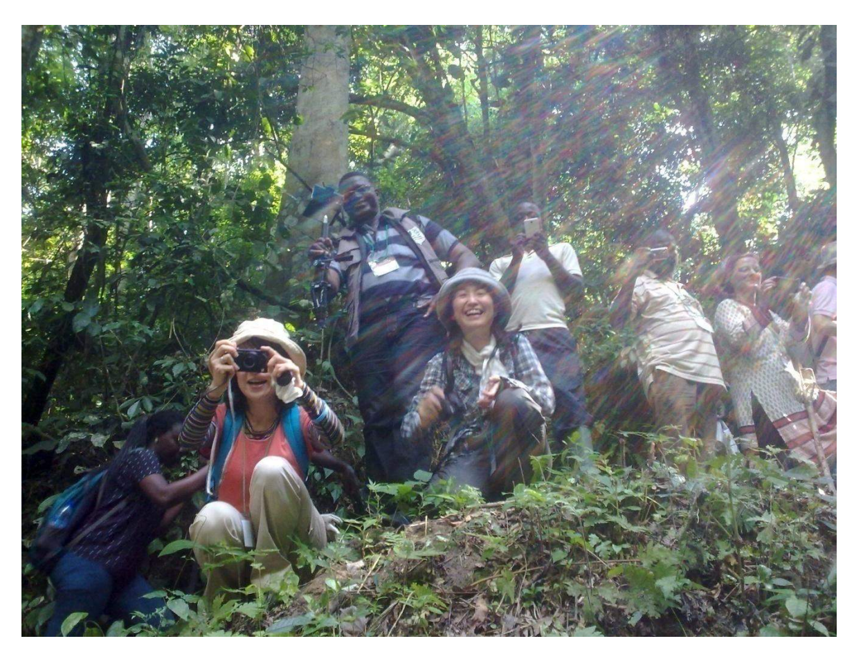
Workshop participants enjoying the excursion to the Atewa Range

After these visits, the workshop participants once again were driven back to the Alisa Hotel in Accra, and the workshop came to its final conclusion, as many went on to further discuss the many issues raised and planned outcomes of the workshop.