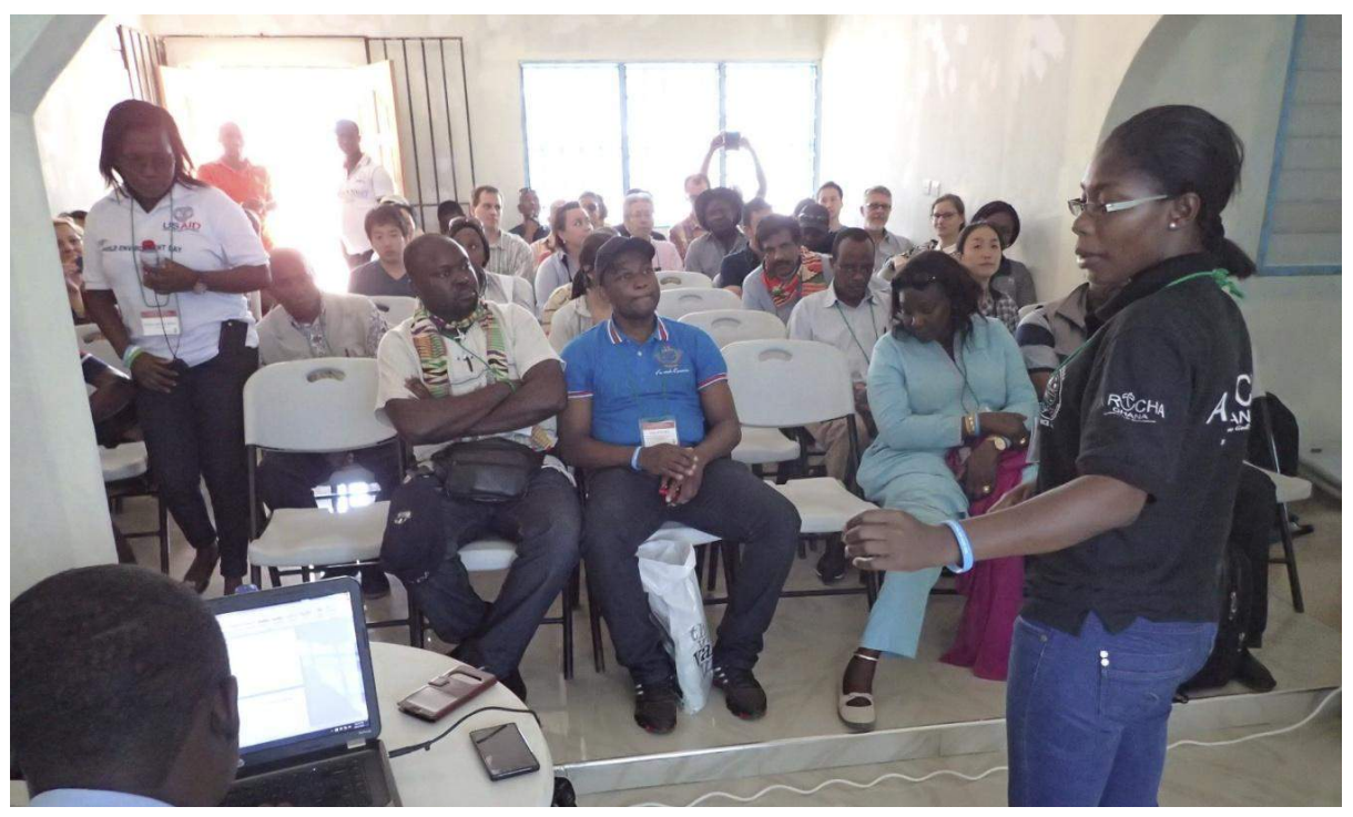
A Rocha Ghana staff give workshop participants an introduction to the Atewa Range

On the way to the excursion site, participants were able to see much of the changing landscape of Ghana, from the urban center of Accra to the outskirts and finally the rural countryside. A Rocha Ghana staff members provided a running commentary on the various facilities, protected areas, watersheds and other features as well as explanations of transportation, governance and historical considerations affecting the country as a whole.