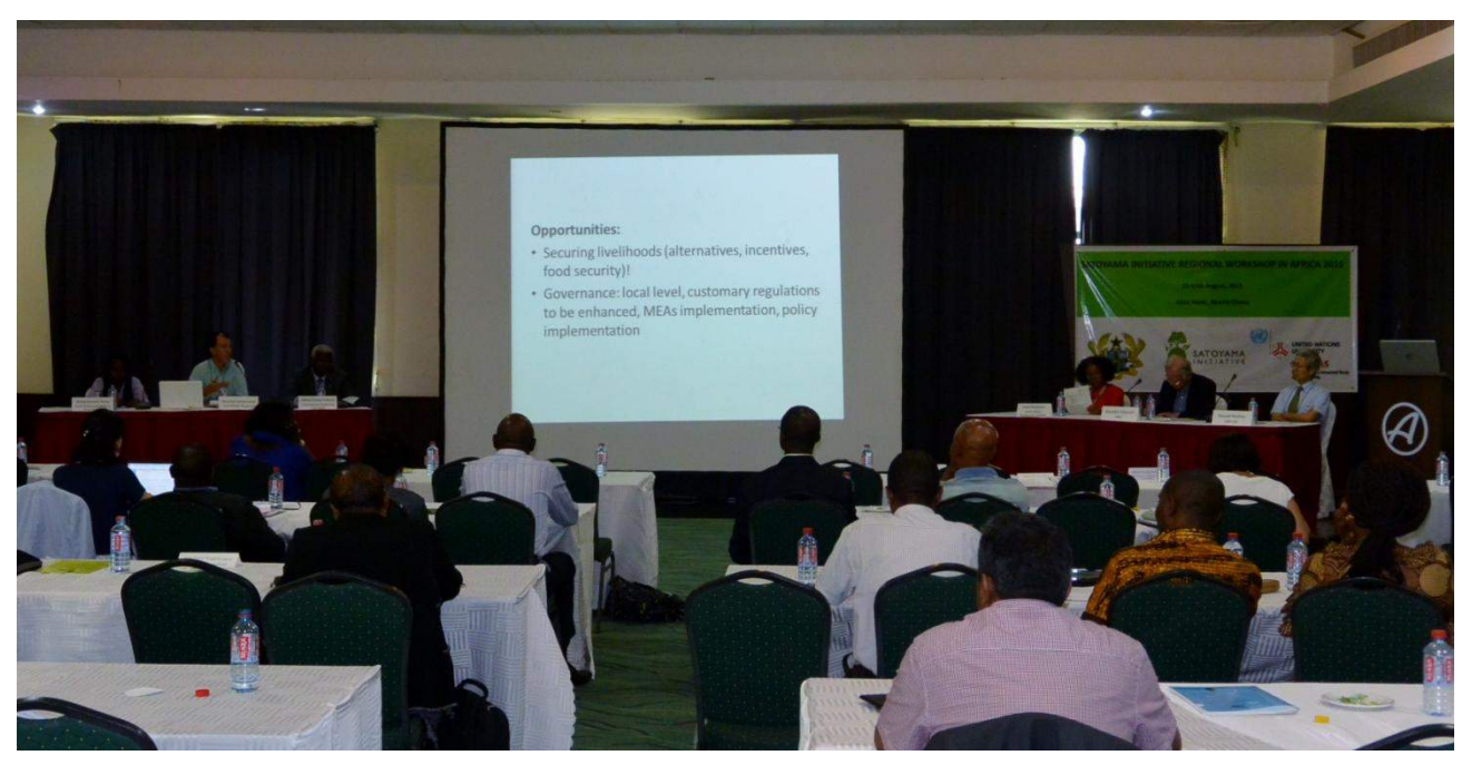
The Satoyama Initiative Regional Workshop in Africa at the Alisa Hotel, Accra, Ghana

Outcomes of the Regional Workshop included the suggestion that IPSI should focus efforts at the regional level, as an effective bridge between local on-the-ground activities and global-scale policy-making processes. One way in which a regional focus is being promoted is in the planned creation of a publication on SEPLS in Africa, featuring some of the cases that were presented at the workshop. It is hoped that not only this publication, but also much of the other knowledge shared and networking connections made at the publication, will contribute both to the further implementation of the Satoyama Initiative locally, regionally and globally and to sustainable development and biodiversity in Africa.