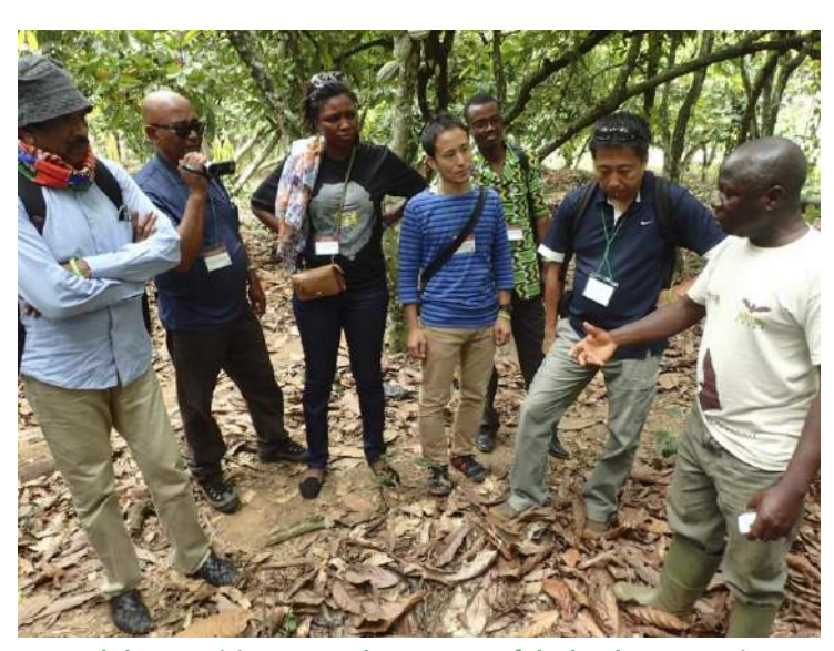
Workshop participants are shown some of the local resources in a cocoa-growing area

Perhaps most relevant to its potential as a National Park site is the Atewa Range's natural beauty. To highlight features that would potentially attract visitors, workshop participants were given the chance to walk a few kilometers along a cleared hiking trail to a waterfall. Along the way they were able to see much of the area's wild flora and fauna, and the rich water resources served to highlight the range's role as a natural water tower providing clean water to downstream areas including Accra.