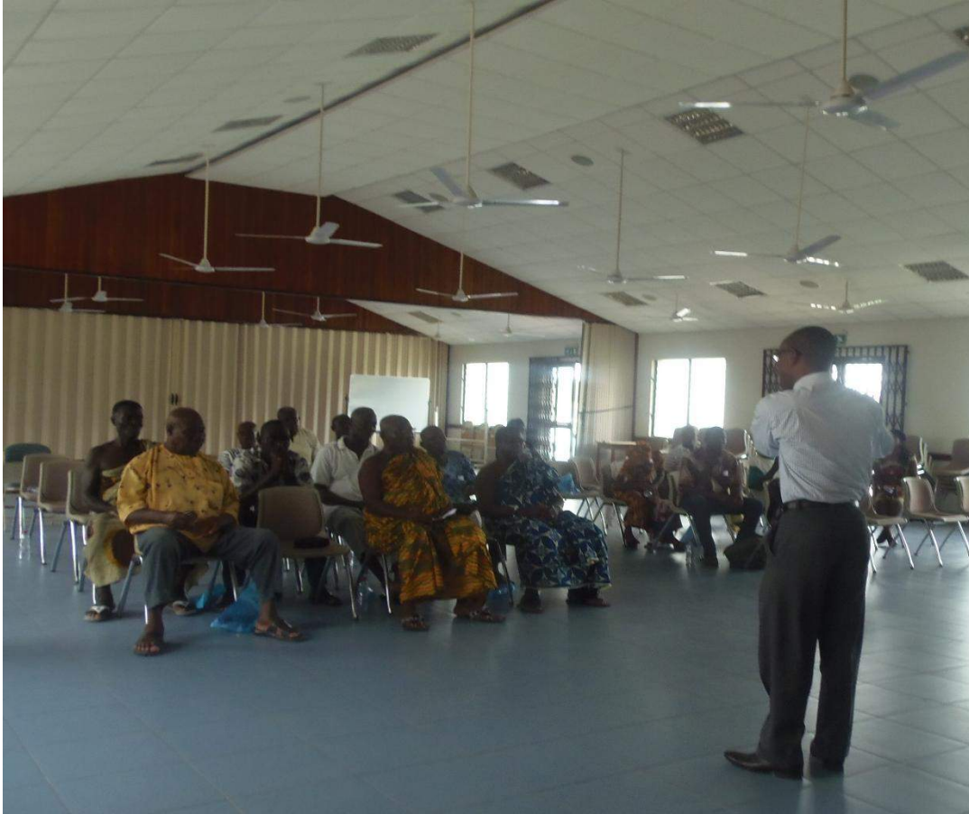
Engagement with stakeholders-by-laws being revised