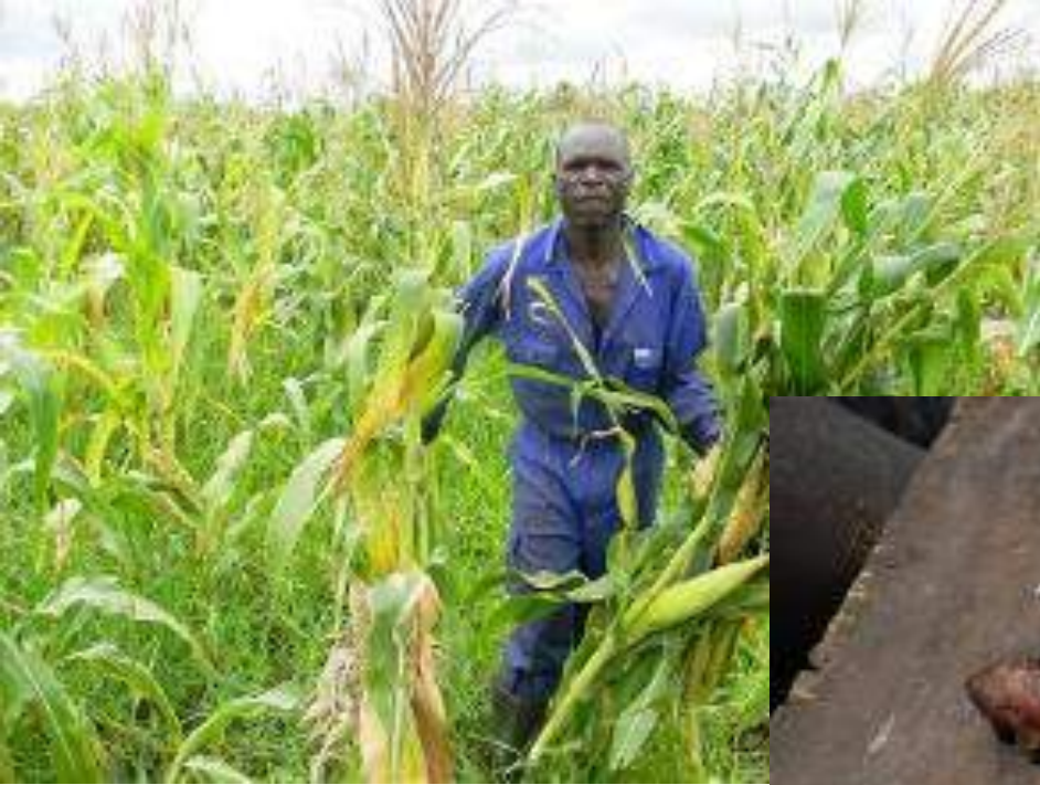
Microclimate for farming