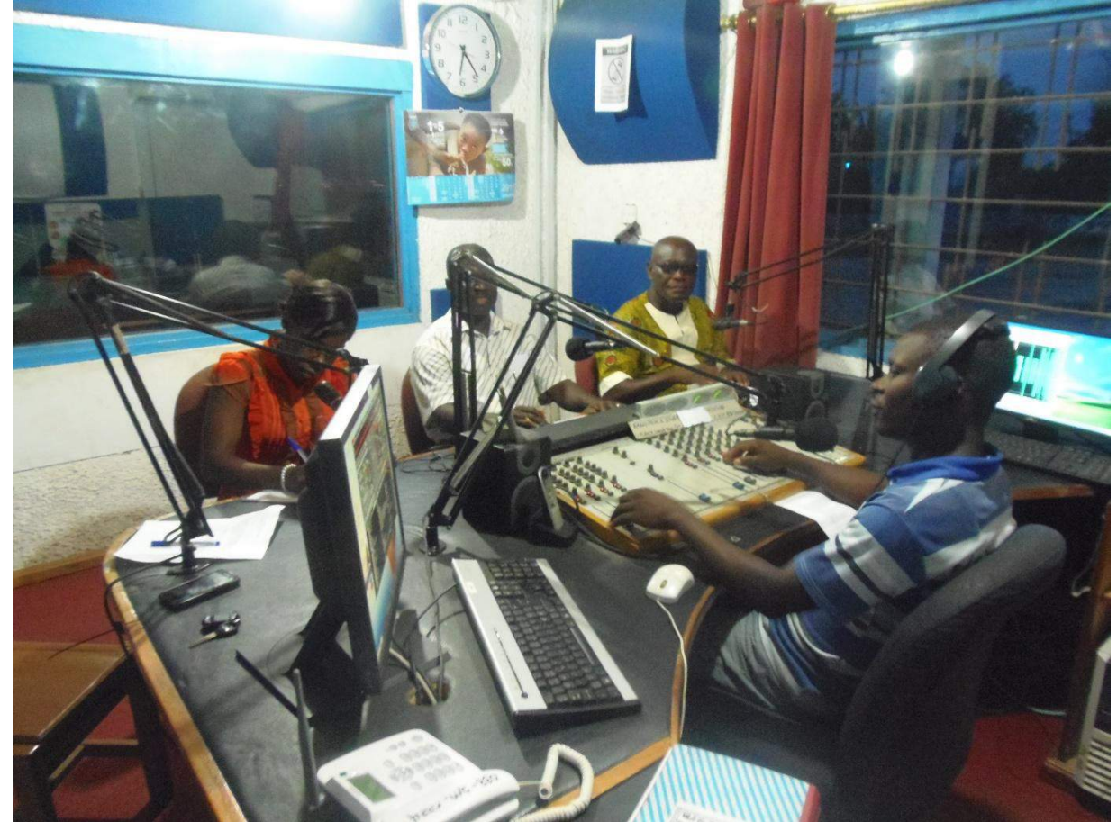
Education through radio, over 1000 people reached