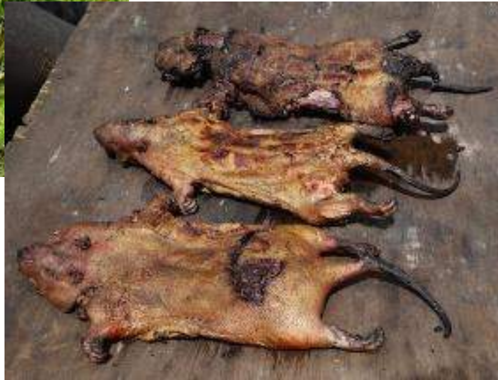
Bushmeat for food