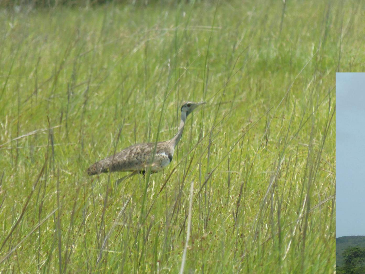
Thicket: wildlife habitat