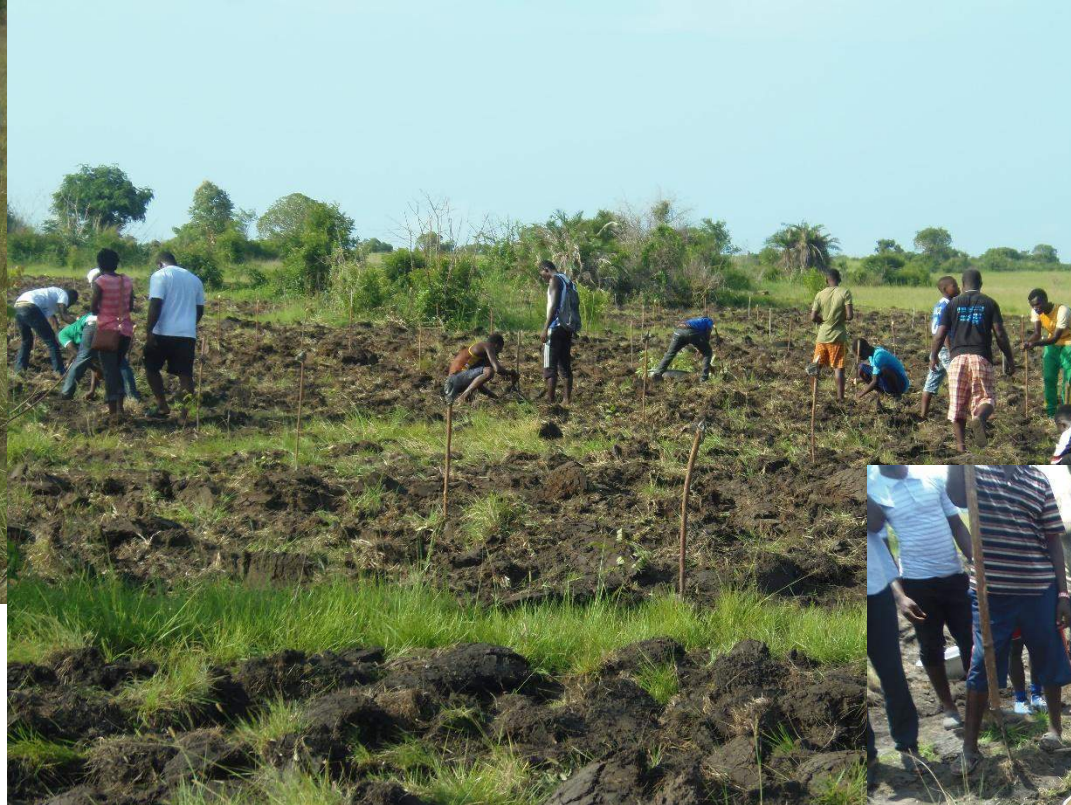
Planting by communities, university students