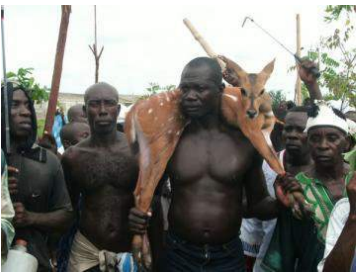
Promotes cultural heritage