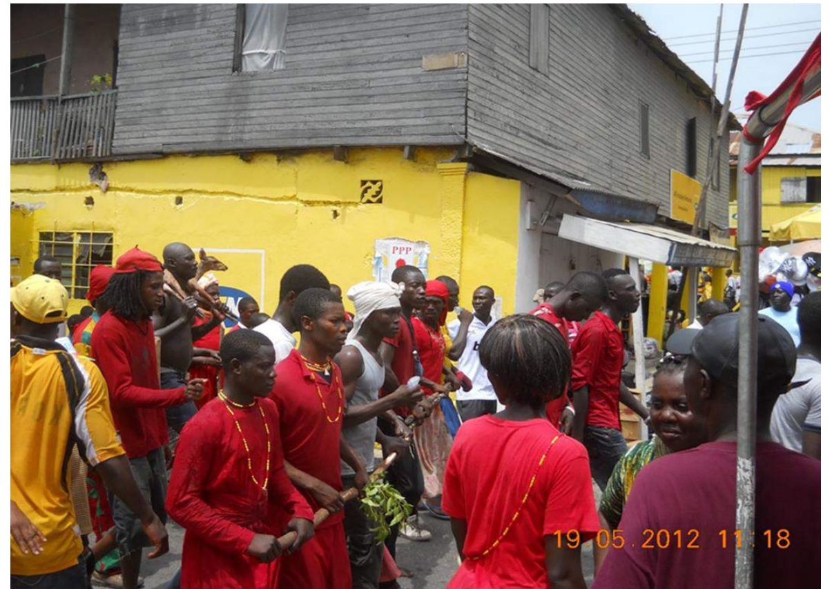
Fosters unity among citizens