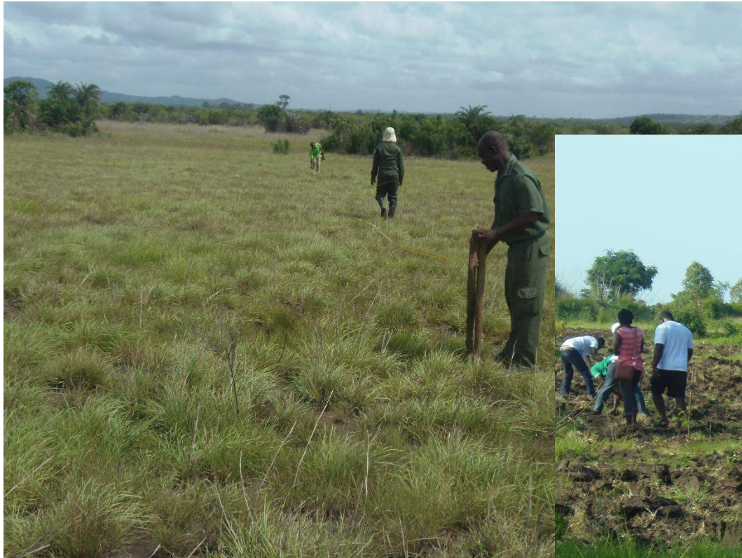
Demarcation of site for planting