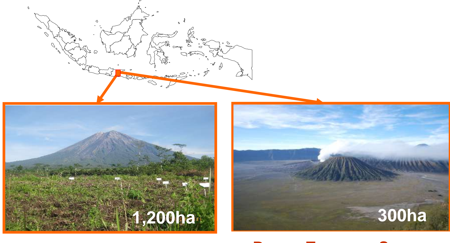
The base of Mt. Semeru