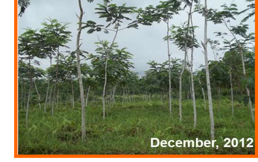
Project site at the foot of Mt. Semeru