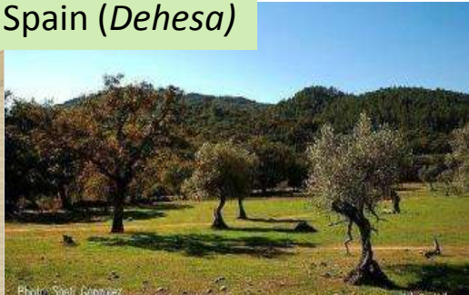
Spain ( Dehesa )