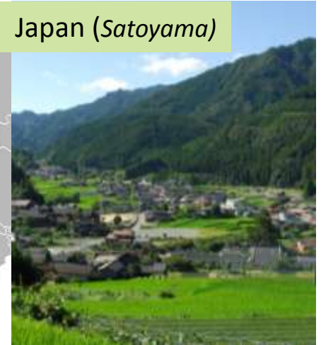
Japan ( Satoyama )