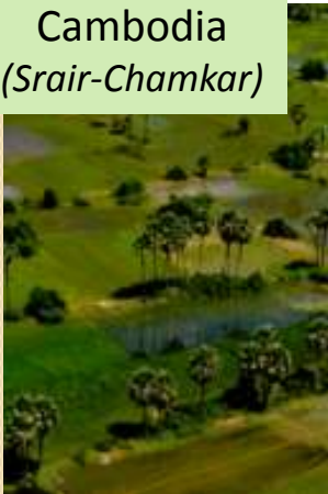
Cambodia ( Srair-Chamkar )