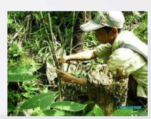
Forest conservation - Laos