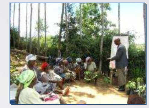
Farmers Workshop- Kenya

Harmonization between Nature Conservation and Human Activities