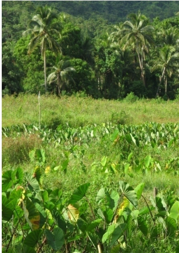
Traditional Pacific taro cultivation in mixed used socio-ecological production landscapes (GEF SGP project, Fiji)