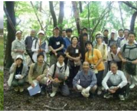
Fieldwork with local people