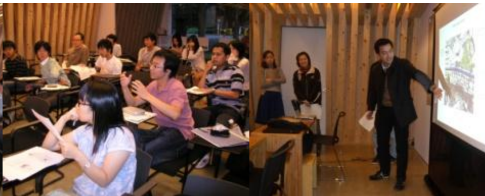
Student's participation in discussion