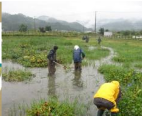
Field survey in abandoned paddy field