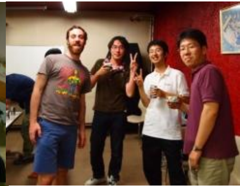
Exchange with foreign students