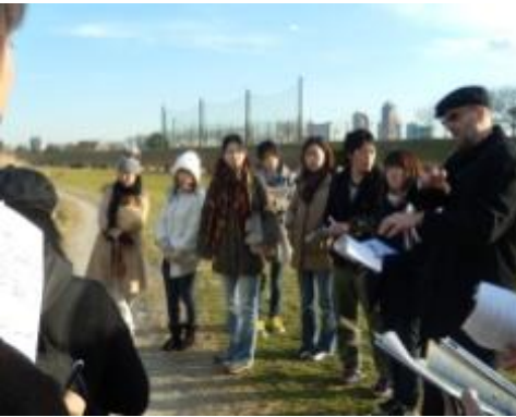
Excursion with foreign lecturer