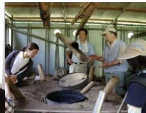
Learning traditional knowledge