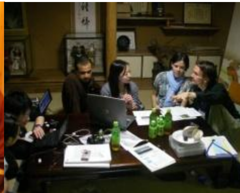
Practical training to build debate skills