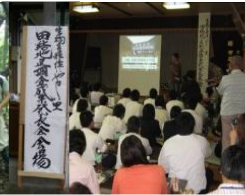
Exchange with local people