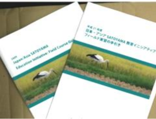
Textbook on field practice both in Japanese and English