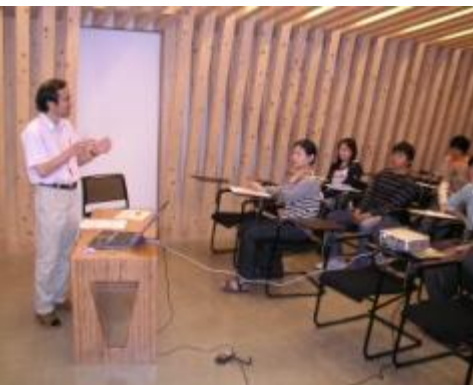
New lecture on overview of Satoyama