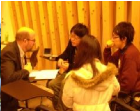
Discussion with foreign students