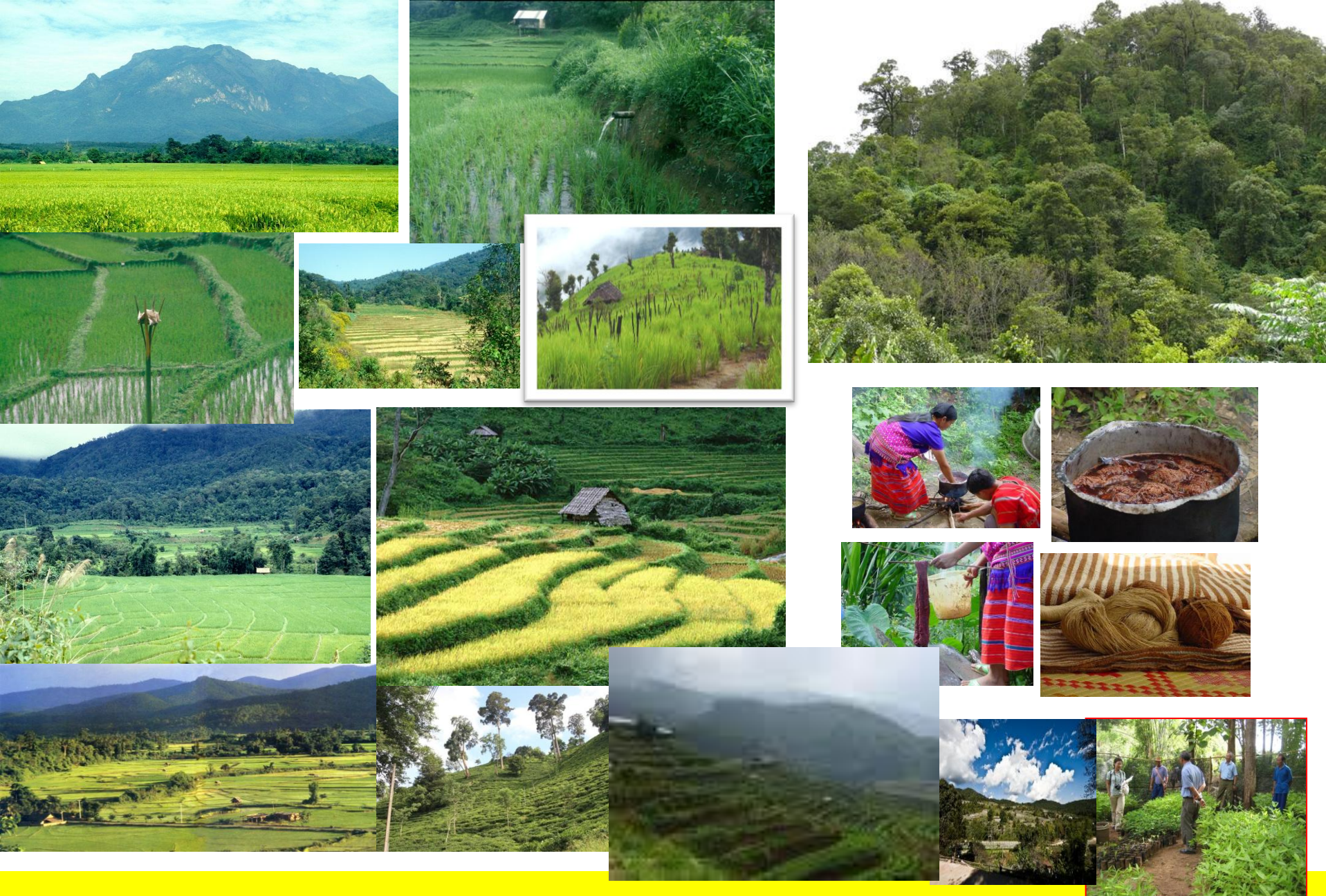
Satoyama – like landscape : Northern Thailand