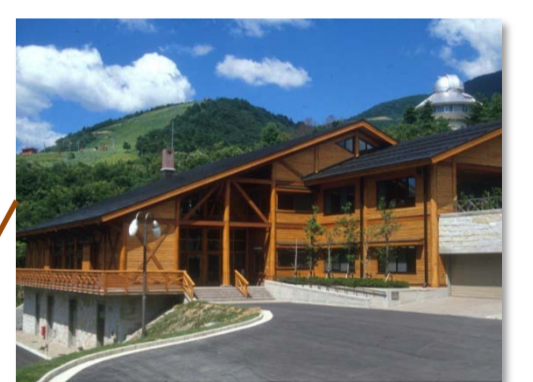
Fukui Nature Conservation Center