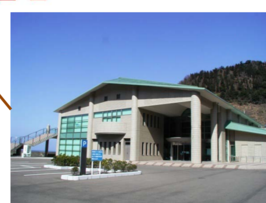
Fukui Coastal Nature Center

□ "Satoyama" Mesh http://www.biodic.go.jp/biodiversity/activity/policy/map/map04/index.html