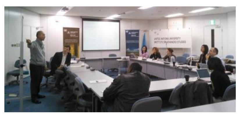
Scoping workshop (April 2013)